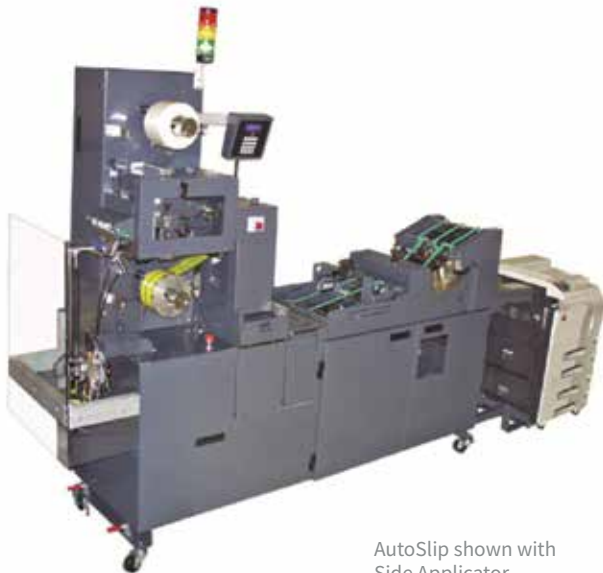
AutoSlip shown with Side Applicator

Note: These specifications are based on our Standard Turn-Key System Custom Products can be developed with other requirements.