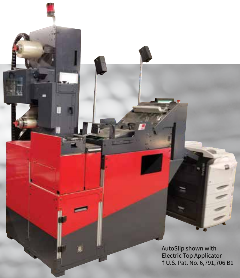
AutoSlip shown with Electric Top Applicator † U.S. Pat. No. 6,791,706 B1

Automated Packing Slip with Top or Side Applicator